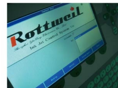
Operation panel, LINUX system