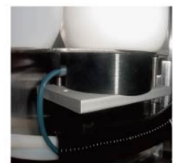
Magnetic stirrer, pigment